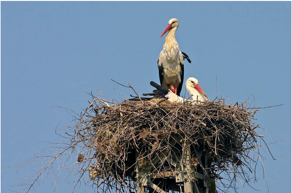
Fig. 3 – Couple of Ciconia ciconia , with an adult in hatching.