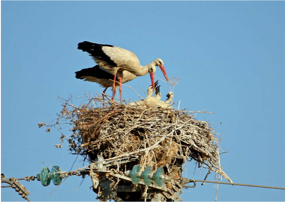
Fig. 4 – Adults of Ciconia ciconia , which feed the chicks on the nest in the Plain of Gela.