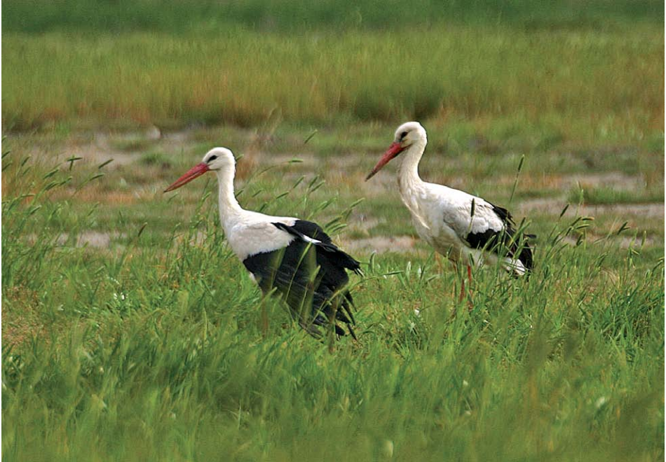
Fig. 2 – Couple of Ciconia ciconia , during feeding in the Plain of Gela.