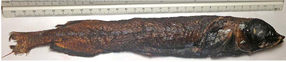
Fig. 2 – The specimen of A. rostratus .

the distribution areas of shrimp trawling due to depletion of the waters subject to overfishing; the second is ecological and refers to fluctuations in deep planktonic biomass that are the main trophic source of this species. The stomach contents analysis, moreover, confirmed data by Carrassón and Matallanas, 1990, 1998; Carrassón and Cartes, 2002 and Follesa et al 2007